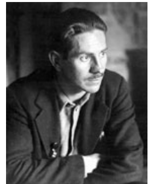
Ed "Doc" Ricketts